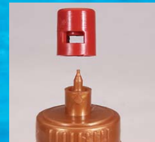
Pull red cap off of bottle.