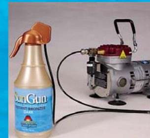
Unit ready to spray. Turn on air supply.