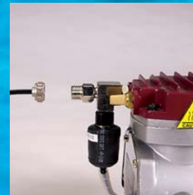
Attach hose to a compressor.