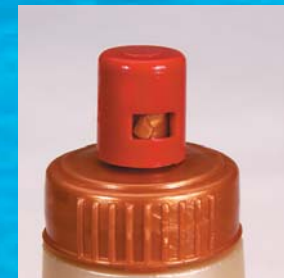
Twist red cap to unlock.