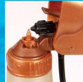
Twist sprayhead into locking position.