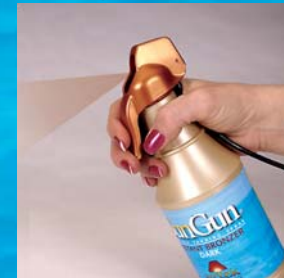
Press trigger completely to spray.